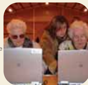
"Computing for the Terrified"

Finally, we are looking at ways of providing adult education classes to members of our local community. This will involve the use of the school's facilities, and of course the expertise of the teaching staff, as we look at ways of introducing Business & Enterprise to a wider audience.